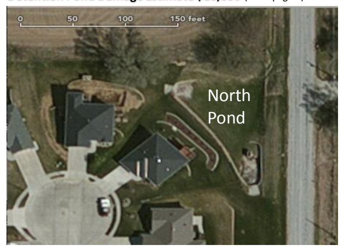
North Pond - Aerial View

Controlled release structures are designed and required to minimize flooding and excessive erosion downstream. The pond volume is designed to detain the estimated largest 100 year rainfall down pour, and then provide a slow release. If the actual rate of rainfall and runoff exceeds the design, the discharge structure is designed to allow an increase in the release rate to prevent failing of the berm around the pond. In addition, the South Pond has a small section lower than the remaining part of the berm to provide a spillway where the overflow drainage would be directed to the historically natural drain area. Maintenance of the ponds requires that if the minimum volume is compromised due to excessive sediment buildup, the bottom of the pond must be excavated to regain the required volume.