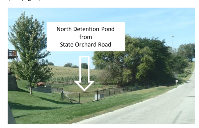
North Pond - State Orchard View

Sediment has accumulated over the almost 15 years since construction, especially around the inlet discharge pipes. Sediment has accumulated at the bottom of the pipe, the pipe support has been eroded, a section of pipe has tilted, and the resulting water jet erodes a hole leaving a pool of water. The hole and retained water fills with algae which becomes odorous in the summer months and a potential insect breeding place. The majority of the existing sediment is believed to have accumulated during the early years of Briarwood development, before the streets, driveways, roofs and grass covered the open ground. (See page 3)