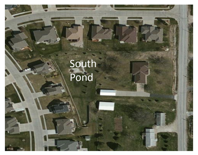
South Pond - Aerial View