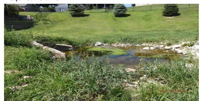
South Pond - Collapsed Inlet

Controlled release structures are designed and required to minimize flooding and excessive erosion downstream. The pond volume is designed to detain the estimated largest 100 year rainfall down pour, and then provide a slow release. If the actual rate of rainfall and runoff exceeds the design, the discharge structure is designed to allow an increase in the release rate to prevent failing of the berm around the pond. In addition, the South Pond has a small section lower than the remaining part of the berm to provide a spillway where the overflow drainage would be directed to the historically natural drain area. Maintenance of the ponds requires that if the minimum volume is compromised due to excessive sediment buildup, the bottom of the pond must be excavated to regain the required volume.