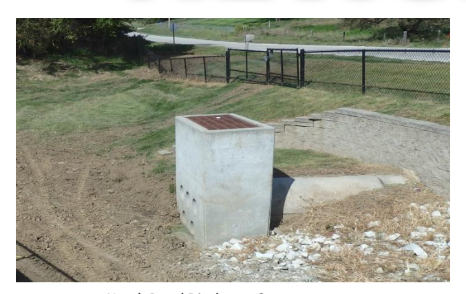
North Pond Discharge Structure

Detention Pond Damage Estimate $10,600 (From page 2) Consequently, once repaired, the structure should last longer than 15 years. While the minimum volume has not been compromised, construction will be required to remove excess sediment, provide a suitable discharge pipe support, replace the damaged discharge pipe section and replace the discharge energy absorbing "scour hole" structure.